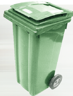
Model : WB120L1