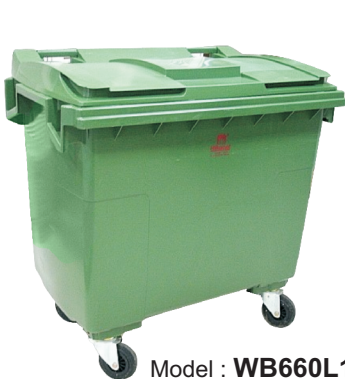
Model : WB660L1