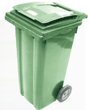
Model : WB240L1