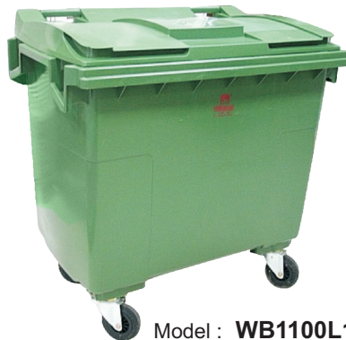
Model : WB1100L1