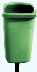
Model : PLB50L1

WB : Wheeled Bin • L : Litres (All dimensions & capacities are approximate)